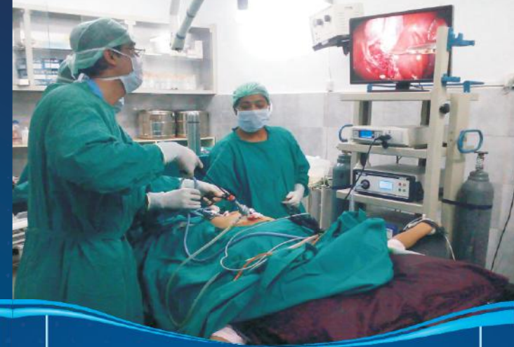
Modular OT with HD Camera Set & State of Art Instruments